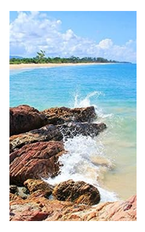
Photo Khao Na Yak Beach Phang Nga Thailand - The Ultimate Tropical Paradise