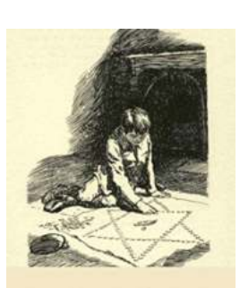
HARDING'S LUCK E. Nesbit

What sets the Harding Luck Original Classics And Annotated series apart is its dedication to enhancing the reading experience. Recognizing the importance of context and analysis, the series includes comprehensive annotations that shed light on various aspects of the story, author's intentions, and historical background. These annotations not only deepen the reader's understanding but also invite them to engage critically with the text.